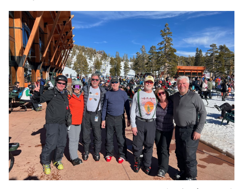
(Continued on page 2)

Many of us took the day off on Wednesday for a variety of adventures, strolling and shopping in town. We visited an Art Gallery in town Marcus-Ashley owned by one of my dear friends, then ventured down to the beach ar-