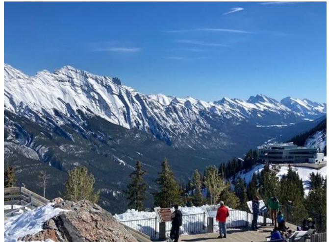
The view from the weather station atop Sulphur Mt.

Not everyone skied all 6 days or at all but there are tons of places to marvel at when not on the slopes. I think the most popular attraction was the Banff Gondola, a 10-minute ride up Sulphur Mountain that gives you 360-degree views of the Canadian Rockies and has a